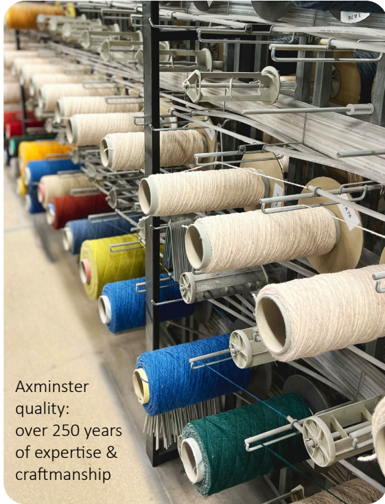
Axminster quality: over 250 years of expertise & craftmanship