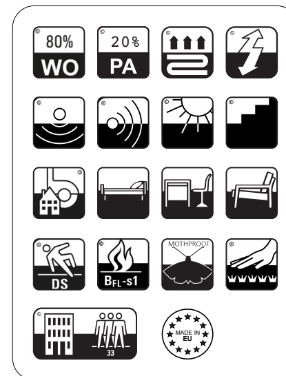
Icon index: see page 92

This brochure comprises our Axminster collection, full of unique designs (all exclusively designed in our studio) to fit your style and quality that fits your needs. Let your stair runner make a statement with Axminster-weave carpets and witness the perfect blend of resilience, charm, and superior quality.